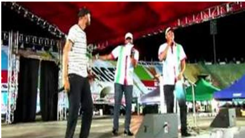
9ice in a stage performance

The adoption of these local dance-steps in 9ice's musical performances as observed by Adedeji (2010) and DJ Wolex (oral interview) is as a result of the exploit of local musical instruments and fusion of local Nigerian rhythms into his music. It was also observed in the cause of this research that, because of the adaptation of local Nigerian dances in the music of 9ice, it is therefore open and easy to dance by both old and young people irrespective of their cultural background or status.