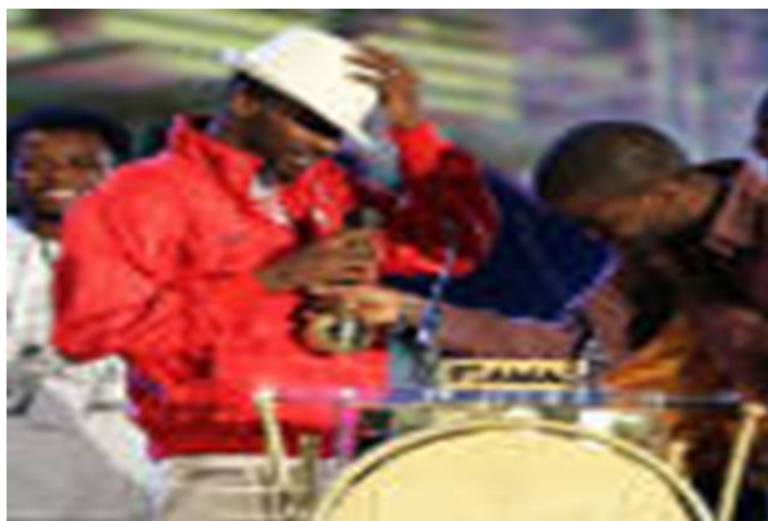
9ice in a stage performance

In his song track title 'Living Things' and 'Money' are the example of songs where 9ice made use of palongo rhythm. It is therefore worthy to note that 9ice displayed creativity by localizing hip-pop music and makes it a 'Nigerian version' or 'Yoruba version' of hip-pop music.