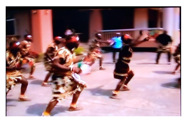
The above pictures show dancers on stage.