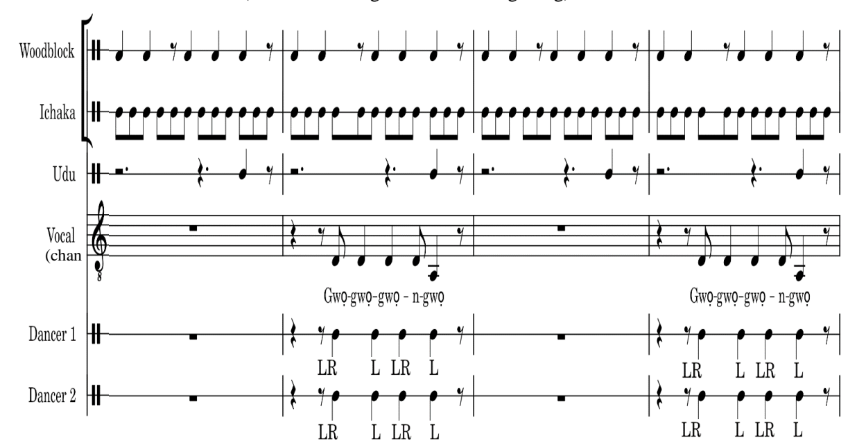
Figure 5: Shows a four-measure snippet from the original version of this dance challenge by Brain Jotter and another dancer (L means left leg and R means right leg)