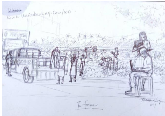
Figure 3.1 Sketch for “The Harvest”

This involves the mounting of a well stretched canvas on a stretcher by pinning the canvas to the wooden stretcher with a gum tacker. After which, the support is ready for painting.