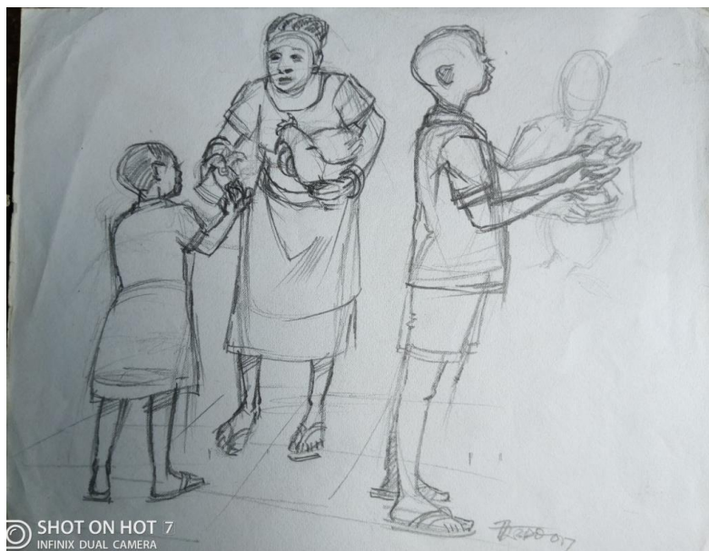
Figure 3.8 Sketch for “The Entrepreneur”