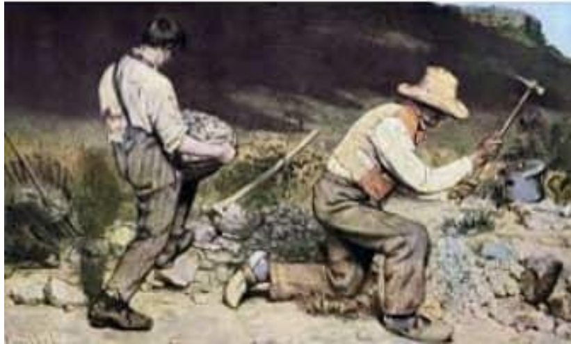
Gustave Courbet, Stone breakers (1849), oil on canvas 65" × 94", Gustave-courbet.com