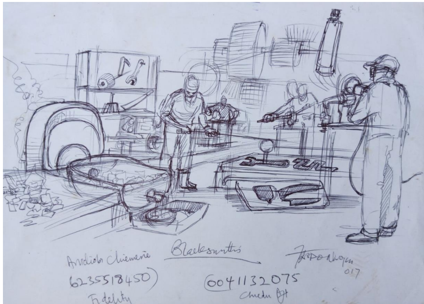
Figure 3.5 Sketch for “Blacksmith’s Forge”