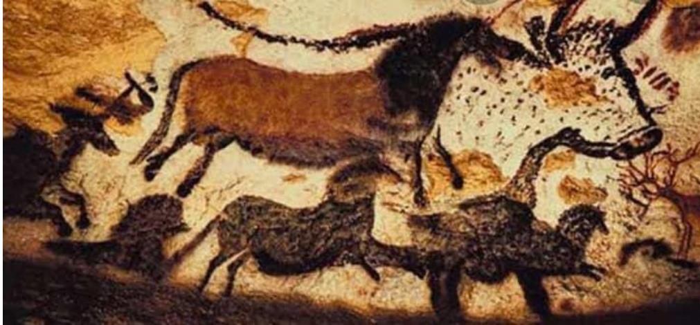
Plate 1: Cave painting in Lascaux, France, ca 15,000 – 13,000 BCE

However, realistic representation, in the context of this study serves as the element that ushers the spectator into the pictorial arena. Evocation of emotions of fear humiliation and like is not intended for the imagery, but that which evokes curiosity as the source of rationality and radical thinking. And radical thinking finds expression in the dynamisms of change and the actualizing the future. Therefore this work intends to seek reality of the subject through the evocation of curiosity and reason.