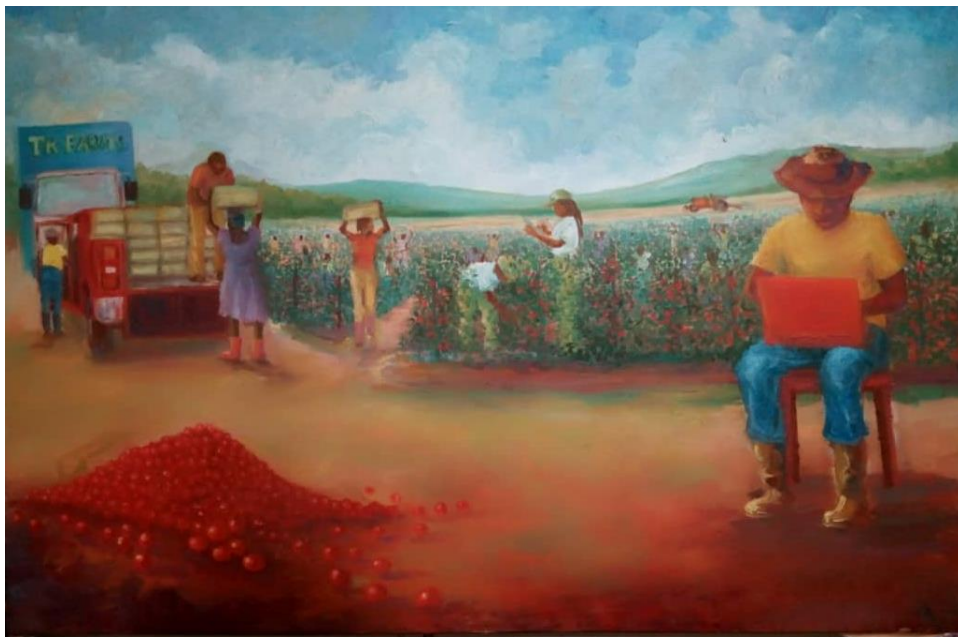
Plate 3.8 "The Harvest" (2018) Acrylic on canvas. 24inches * 36inches