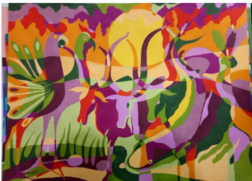
Plate 5: "The Agrian World" (2018) Acrylic on canvas, 24inches * 36inches