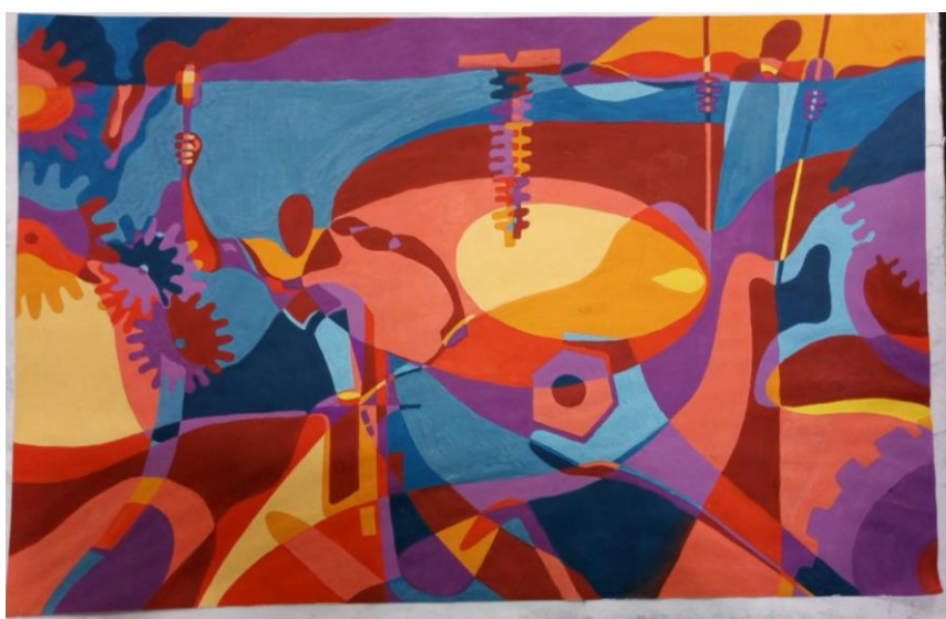
Plate 6: "Fabrication" (2018) Acrylic on canvas, 24inches * 36inches