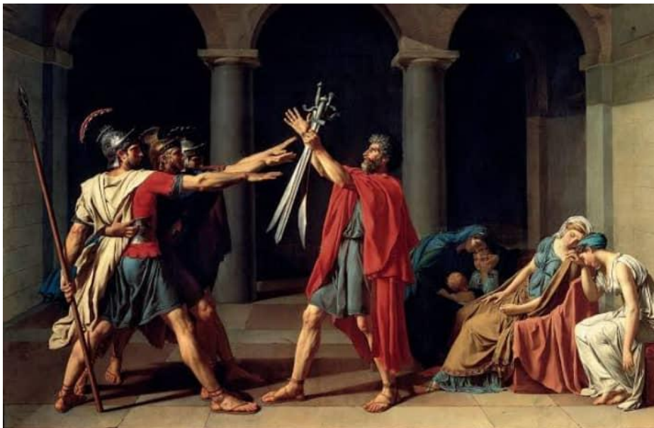
Jacques – Louis David, The oath of Horatti (1784), oil on canvas, 10'10" × 14', Source: en.wikipedia.org