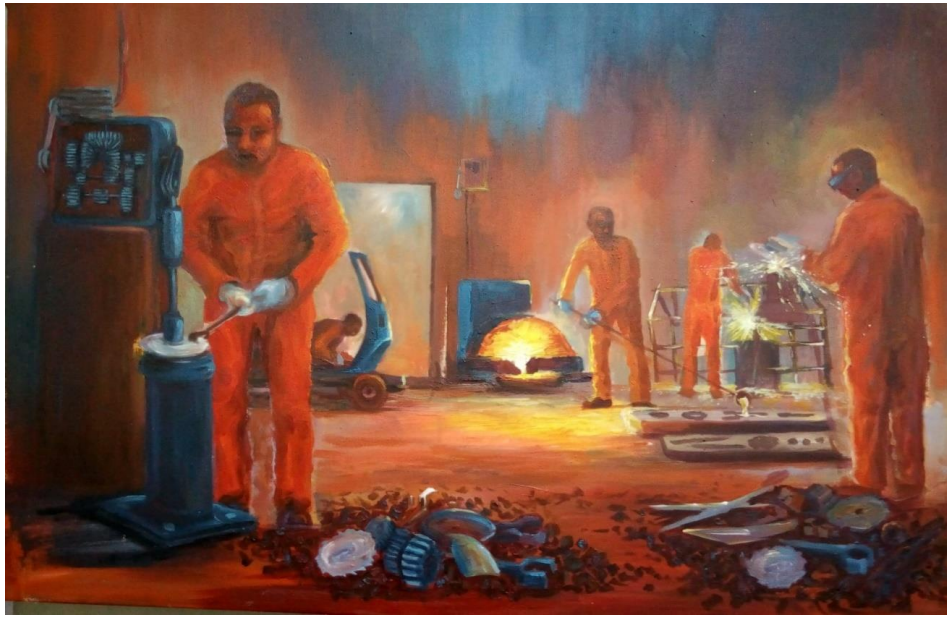
Plate 7: "The Blacksmith's Forge" (2018) Acrylic on canvas, 24inches * 36inches