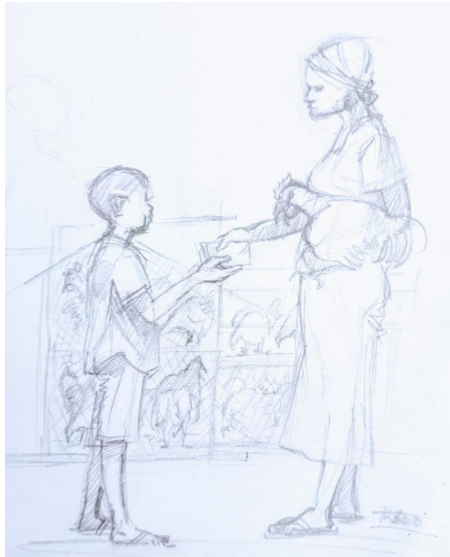
Figure 3.7 Sketch for “The Entrepreneur”