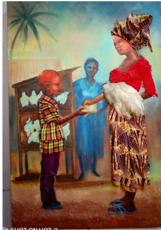
Plate 3: "The Ranch" (2017). Acrylic on canvas, 24 inches * 36 inches

and interpretation of indigenous occupation and perception of painting as mere decoration, in general. This futuristic realism serves as the portal that launches the viewer into realities that lie beyond the veil of conventional interpretations and assertions.