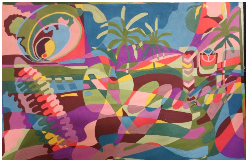
Plate 4: The Entrepreneur (2018). Mixed media, 24 inches * 36 inches