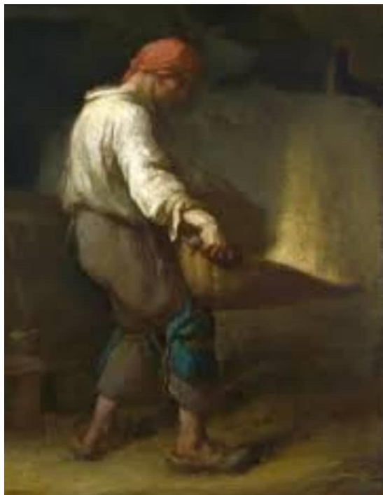
Jean – Francois Millet, Winnower (1847 – 48), oil on canvas, 14.9” × 11.4”