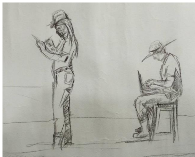
Figure 3.2 “The Harvest” Detail