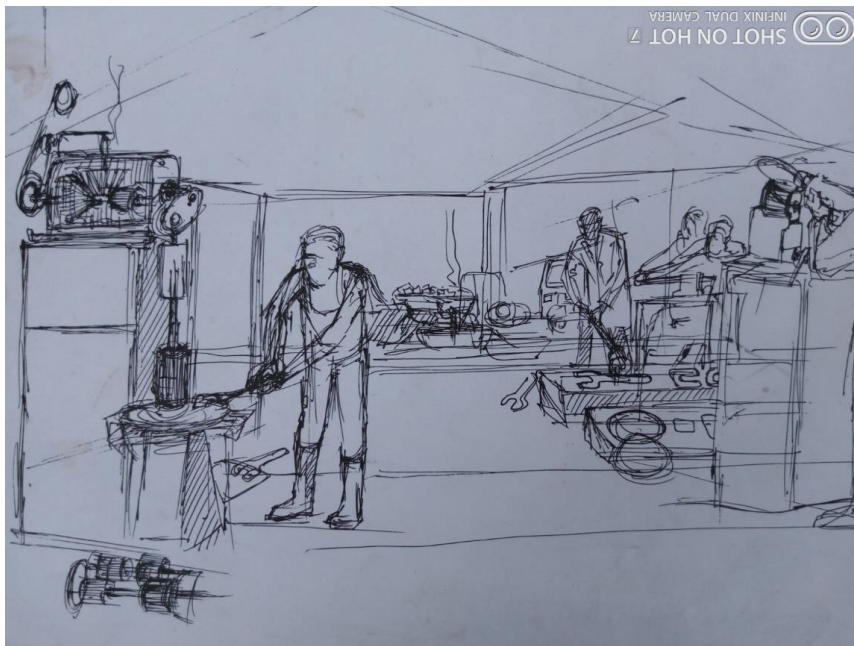
Figure 3.6 Sketch for “Blacksmith’s Forge”