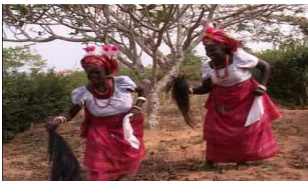
Plate 6: This dance step symbolizes Oyiri Nnoo

women, black horse tail and the white handkerchief. This dance movement communicatively portrays the total acceptance of any married woman in Afikpo community in her husband's community. The total acceptance is always effectively based on the mutual understanding between her and whatever she meets in her husband's house. The following portrays the yardstick for measuring total acceptance in oyiri-nnoo dance movement formation. Those yardsticks are as follows: