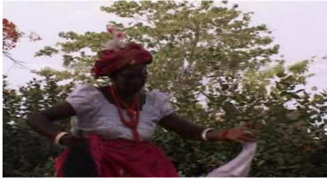
Plate 5: This movement represents Akwa Oyiri Bere Di ya

Oyiri (the barren woman) is advised to always do everything humanly possible in putting a smile on her husband's face.