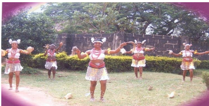
Plate 3: A cross section of maidens on readiness formation

The body communicative potency of initiates here presents them as being fully trained, informed and equipped on how to take care of the house, their husband and their children. Also, it means the initiates are fully prepared for marriage and any man that marries them at this point, marries forever to breakthrough and open doors. The semiotic- interpretative gift that follows the initiates at this point is always showcased whenever they spread their hands during performance which implies – 'we are a blessing to any man that marries us and remains faithful to us'. The initiates at this point are seen as full initiates and are officially welcomed into Nkwawite dance performance.