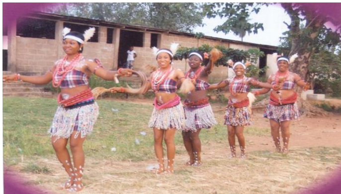
Plate 1: A cross section of maidens on the sampling formation

This Sampling formation is dotingly called the formation of queens. This formation is solely meant for maidens who are complete women and have all it takes to make their various would-be husbands remain forever faithful to them. The idea of being complete women is that the maidens are virgins who will get impregnated on their first sexual intercourse with their would-be husbands. The special gift from their ‘chi’ to those who maintain their virginity before becoming initiates into the dance is a male child. The male child serves as a proof of faithfulness of the woman before getting married to her husband. At this point, the initiates are told to always be attractive to their husbands before, during and after child bearing, because once they stop being attractive, their husbands will have the necessary justifications to cheat on them. They are also advised to always expose those attractive parts of their body like their stomach, breasts, waist, laps and hair, because once all these are well kept too, their husbands will forever remain faithful to them. It is at