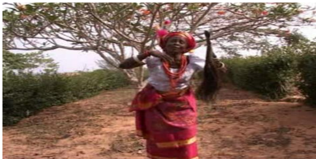
Plate 4: This dance movement symbolically represents akwa Oyiri na chi ya