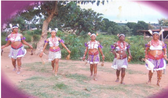
Plate 2: A cross section of maidens on bravery formation

This can be interpreted as the moment of tribulations in the various families the women will be married into. The initiates are here reminded that marriage is not a bed of roses, rather at times the taste differs like;